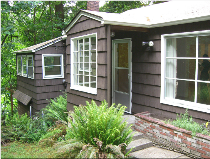
Another Outside View