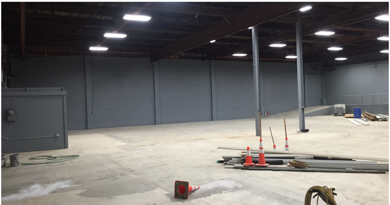
South side facing north