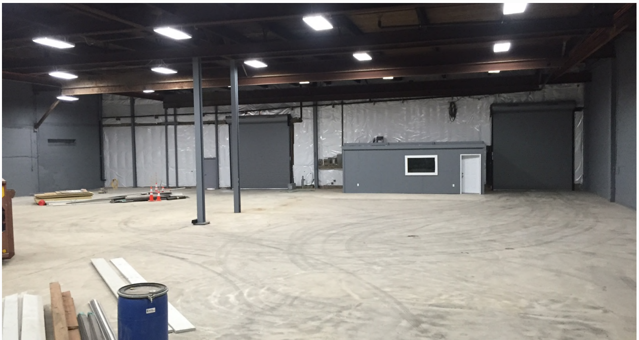
South side facing south