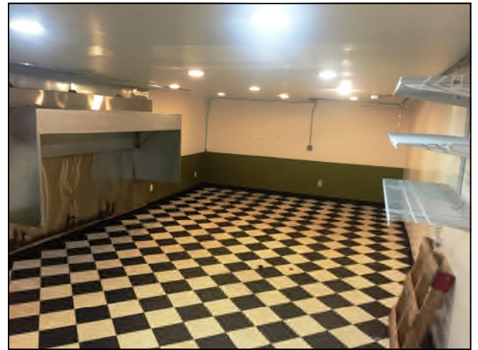
View from Stairs