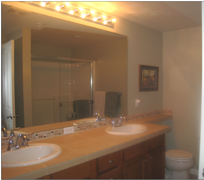
Bathroom with Double Sinks