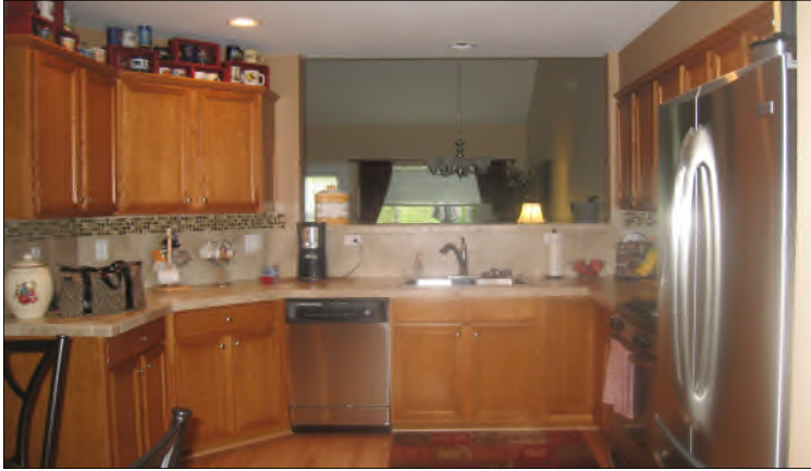
Large Eat-In Kitchen with Hardwood Floors