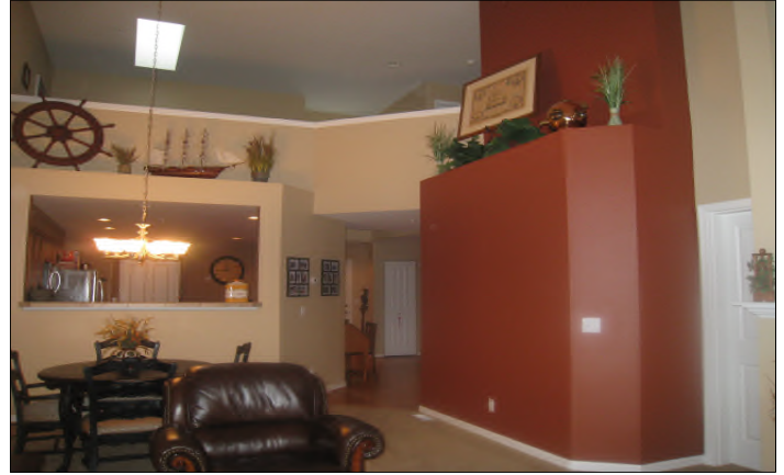
Living Room & Dining Area with Vaulted Ceilings