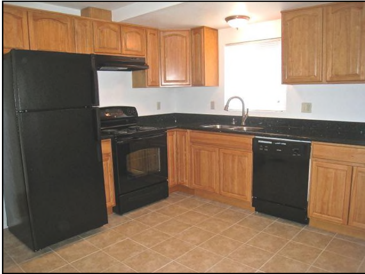
Kitchen with new appliances