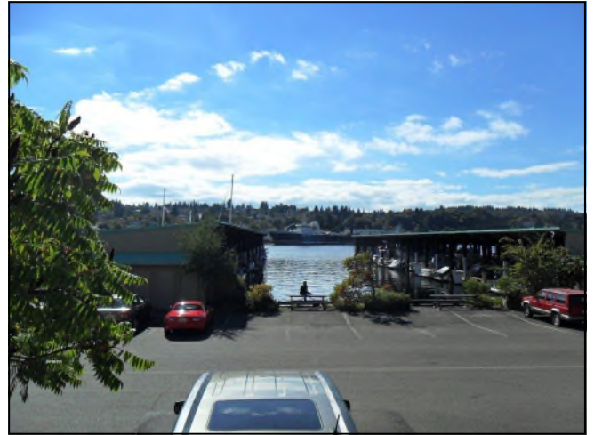
View from office window

5305 Shilshole Ave NW, Suite 150, Seattle WA 98107