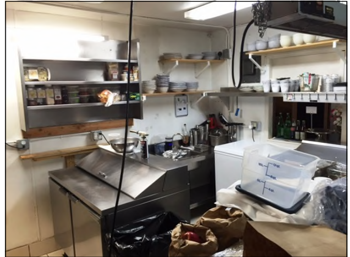
Some kitchen equipment for sale