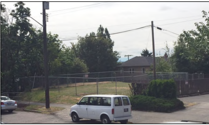
Property from Broadway & Alder