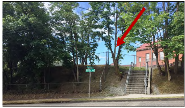
Property from Boren