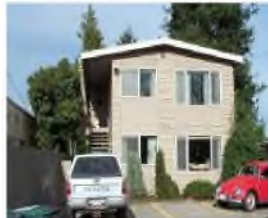
#3 - Maple Leaf Building 2118 NE 85 th Street