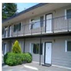
#4 - Sand Point Crest 12000 Sand Point Way NE