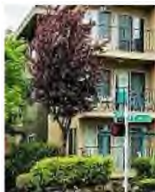
#1 - Park Place 12003 15 th Ave NE