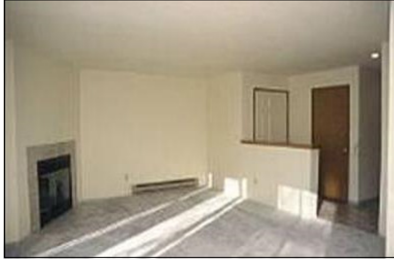
Dining Room & Living Room with Fireplace