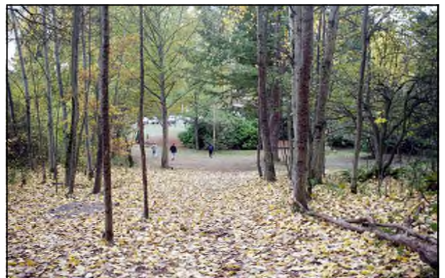
North Seattle Park