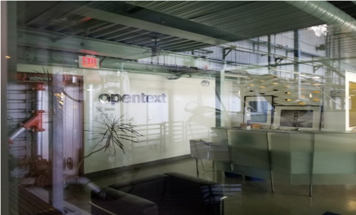
Open Floor Plan