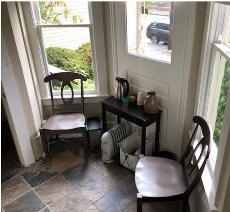
Second floor lobby