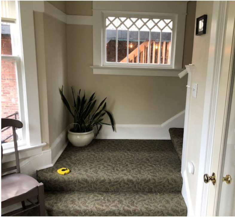
Entry from Porch to second floor