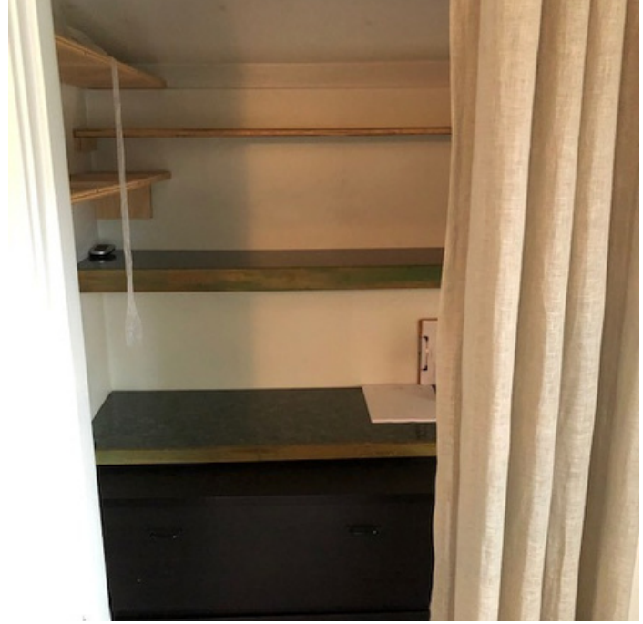
Closet Storage Space Suite 202