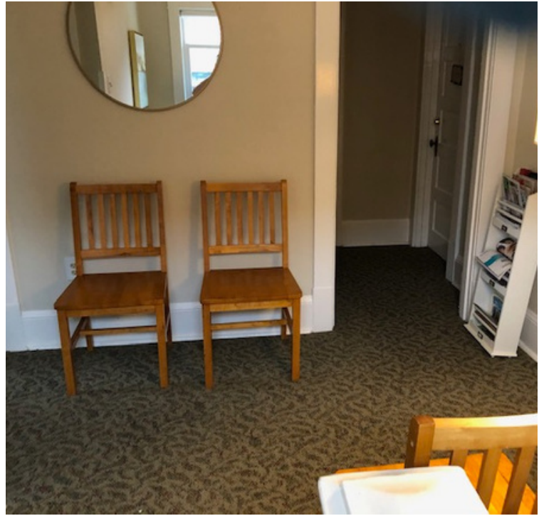
Second floor waiting Area