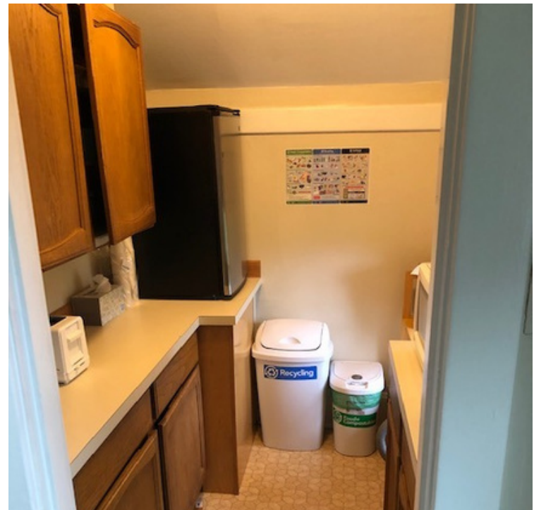
Shared kitchen nook