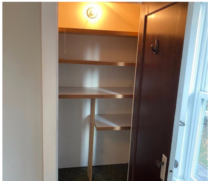
Closet Storage Space Suite 203