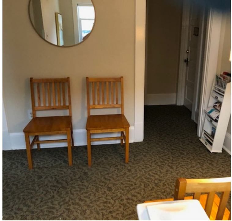
Second floor waiting Area