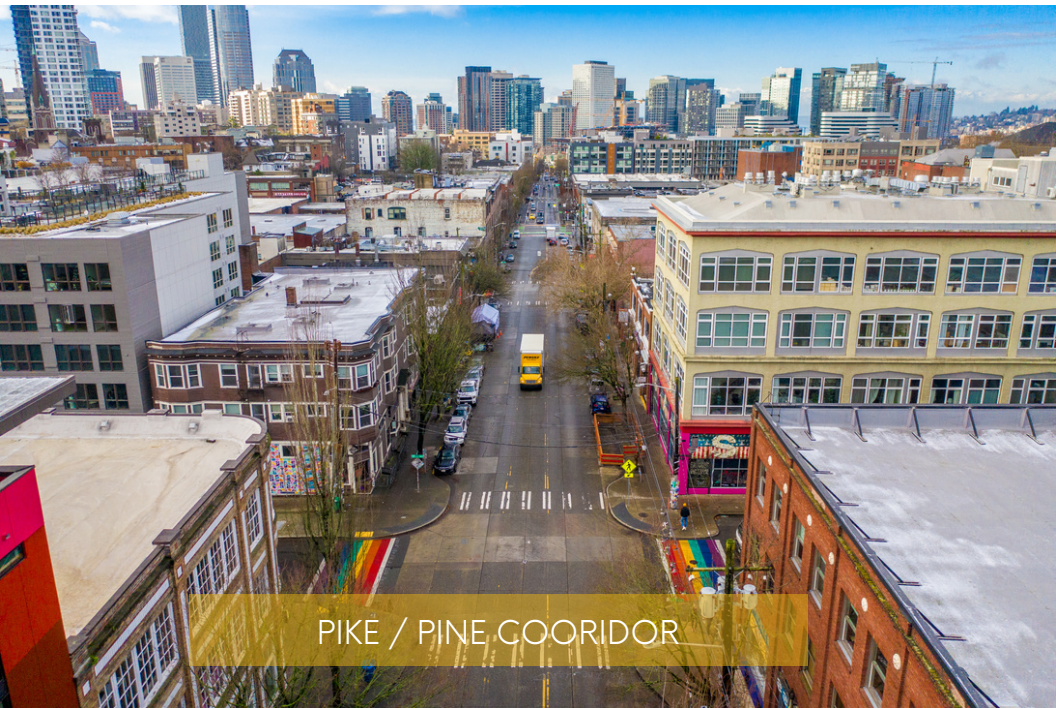
PIKE / PINE COORIDOR