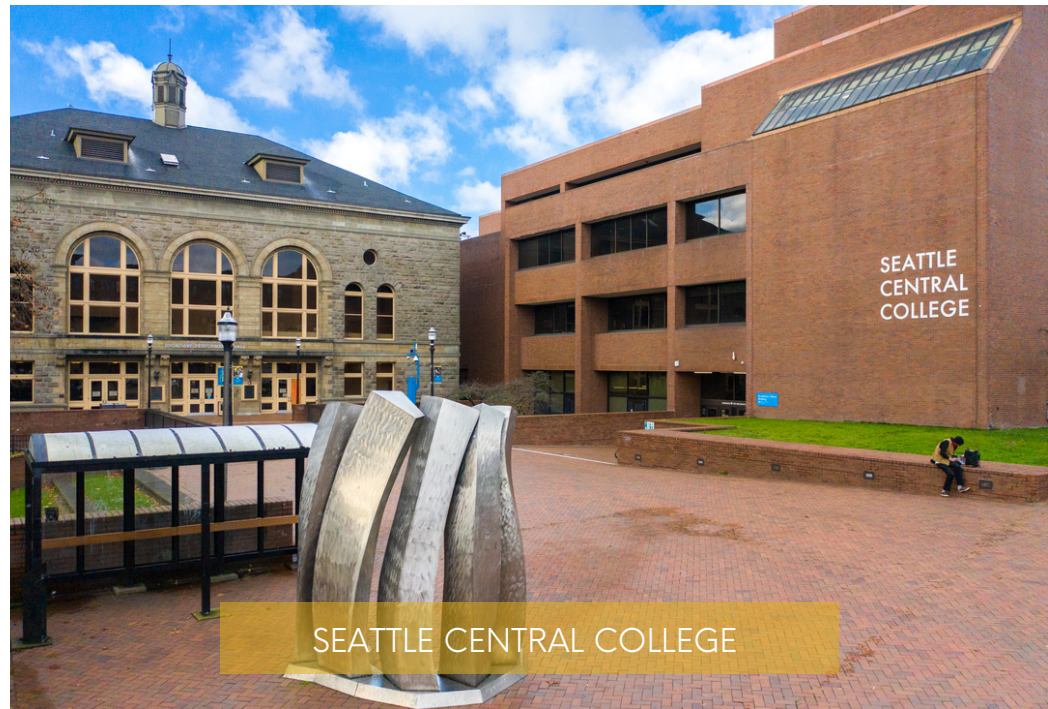
SEATTLE CENTRAL COLLEGE

Capitol Hill is Seattle's most densely populated neighborhood. It's central location to downtown Seattle, and South Lake Union makes it one of the most desirable neighborhoods in Seattle. This vibrant and diverse community is teeming with popular restaurants, bars, and stylish boutiques to explore. If recreation is more your speed, visit Volunteer Park. This large 48-acre park houses the Seattle Asian Art Museum, tennis courts, picnic tables, conservatory, and water tower observation deck. Capitol Hill is a great place to work, whether you are in the tech field or an artist. It is also a hub for medical workers due to the close proximity of Virginia Mason , Swedish and Kaiser Permanente. Home to Seattle University and Seattle Central College, Capitol Hill also has a large population of young adults with the median age being 35. This creates a large demand for apartments and commercial businesses.